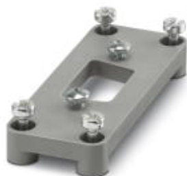
D-SUB adapter plate, for one D-SUB connector, no. of positions 9, housing series HC-D 15...

Please be informed that the data shown in this PDF Document is generated from our Online Catalog. Please find the complete data in the user's documentation. Our General Terms of Use for Downloads are valid ( http://phoenixcontact.com/download )