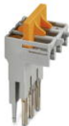
Switching jumper, pitch: 8.2 mm, length: 24.7 mm, width: 24.6 mm, number of positions: 3, color: gray/orange

Please be informed that the data shown in this PDF Document is generated from our Online Catalog. Please find the complete data in the user's documentation. Our General Terms of Use for Downloads are valid ( http://phoenixcontact.com/download )