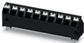
The figure shows the 10-position version

PCB terminal block, nominal current: 13.5 A, nom. voltage: 320 V, pitch: 5.08 mm, number of positions: 9, connection method: Push-in spring connection, mounting: THR soldering, conductor/PCB connection direction: 45°, color: black