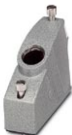
Powder-coated sleeve housing, with metric cable entry, locking screws with knurled head

Please be informed that the data shown in this PDF Document is generated from our Online Catalog. Please find the complete data in the user's documentation. Our General Terms of Use for Downloads are valid ( http://phoenixcontact.com/download )