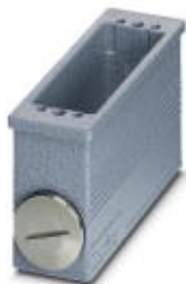
Box mounting base, made of metal, powder-coated type 3, number of modules 4, cable screw connection Pg21

Please be informed that the data shown in this PDF Document is generated from our Online Catalog. Please find the complete data in the user's documentation. Our General Terms of Use for Downloads are valid ( http://phoenixcontact.com/download )