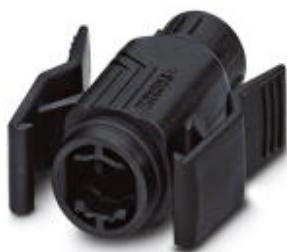
RJ45 sleeve housings, degree of protection: IP67, number of positions: 8, material: PA, cable outlet: straight, color: jet black RAL 9005

Please be informed that the data shown in this PDF Document is generated from our Online Catalog. Please find the complete data in the user's documentation. Our General Terms of Use for Downloads are valid ( http://phoenixcontact.com/download )