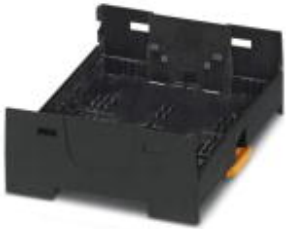
Component housing, Lower part, color: black, width: 90 mm

Please be informed that the data shown in this PDF Document is generated from our Online Catalog. Please find the complete data in the user's documentation. Our General Terms of Use for Downloads are valid ( http://phoenixcontact.com/download )