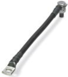
Connecting cable for FLT-ISG-100-EX, length 200 mm.

Please be informed that the data shown in this PDF Document is generated from our Online Catalog. Please find the complete data in the user's documentation. Our General Terms of Use for Downloads are valid ( http://phoenixcontact.com/download )