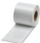
Marking foil for zack marker strip, white, labeled according to customer specifications, mounting type: adhesive, for terminal block width: 4.15 mm, lettering field size: continuous x 3.8 mm

Marking foil for zack marker strip - SK 3,8 REEL P4,15 WH CUS - 0825990