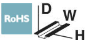
The figure shows EMG 17-REL/KSR-G 24/2E/SO38

Relay module, with soldered-in miniature switching relay, contact (AgNi): Medium to large loads, double A2 connection, 1 PDT, 120 V AC/DC input voltage