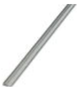
Continuous plug-in bridge, length: 500 mm, color: gray

Continuous plug-in bridge - FBST 500-PLC GY - 2966838