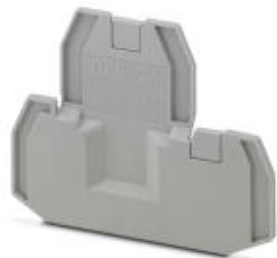
End cover, length: 75.6 mm, width: 2.2 mm, height: 57.5 mm, color: gray

Please be informed that the data shown in this PDF Document is generated from our Online Catalog. Please find the complete data in the user's documentation. Our General Terms of Use for Downloads are valid ( http://phoenixcontact.com/download )