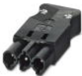
Connector for series connection, black, 3-pos.