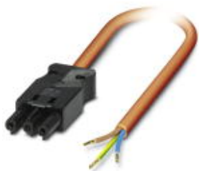
Power cable, 3-position, PVC, orange RAL 2004, free cable end, on Socket straight, black, cable length: 3 m

Please be informed that the data shown in this PDF Document is generated from our Online Catalog. Please find the complete data in the user's documentation. Our General Terms of Use for Downloads are valid ( http://phoenixcontact.com/download )