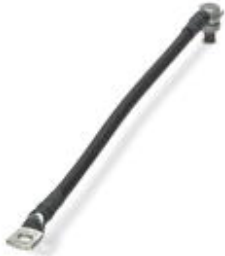
Connecting cable for FLT-ISG-100-EX, length 300 mm.

Please be informed that the data shown in this PDF Document is generated from our Online Catalog. Please find the complete data in the user's documentation. Our General Terms of Use for Downloads are valid ( http://phoenixcontact.com/download )