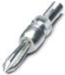
Test plugs, with solder connection up to 1 mm 2 conductor cross section, color: gray