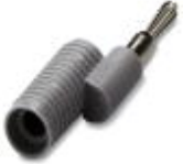
Reducing plug, color: gray