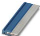
Plug-in bridge, length: 50 mm, color: blue

Plug-in bridge - FBST 50-PLC BU - 1081051