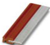
Plug-in bridge, length: 50 mm, color: red

Plug-in bridge - FBST 50-PLC RD - 1081050