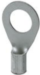
Ring cable lug, non-insulated, 16 mm 2 , M12

Please be informed that the data shown in this PDF Document is generated from our Online Catalog. Please find the complete data in the user's documentation. Our General Terms of Use for Downloads are valid ( http://phoenixcontact.com/download )