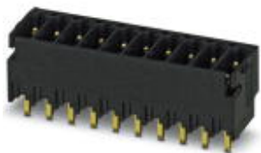
The figure shows a 10-pos. version with 20 contacts

PCB headers, nominal current: 6 A, rated voltage (III/2): 160 V, number of positions: 14, pitch: 2.54 mm, color: black, contact surface: Gold, mounting: THR soldering