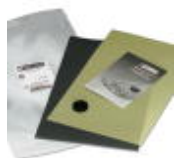
Polymer fiber polishing set, for F-SMA quick mounting connectors

Assembly tool - PSM-SET-FSMA-POLISH - 2799348