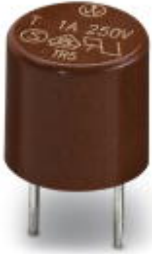
Replacement fuse, for INTERBUS-ST modules

Please be informed that the data shown in this PDF Document is generated from our Online Catalog. Please find the complete data in the user's documentation. Our General Terms of Use for Downloads are valid ( http://phoenixcontact.com/download )