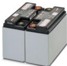
Replacement battery for UPS-BAT/VRLA-WTR... energy storage

Please be informed that the data shown in this PDF Document is generated from our Online Catalog. Please find the complete data in the user's documentation. Our General Terms of Use for Downloads are valid ( http://phoenixcontact.com/download )