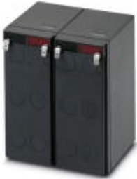
Replacement battery for UPS-BAT/VRLA... energy storage

Please be informed that the data shown in this PDF Document is generated from our Online Catalog. Please find the complete data in the user's documentation. Our General Terms of Use for Downloads are valid ( http://phoenixcontact.com/download )