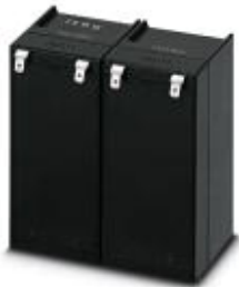
Replacement battery for UPS-BAT/VRLA... energy storage

Please be informed that the data shown in this PDF Document is generated from our Online Catalog. Please find the complete data in the user's documentation. Our General Terms of Use for Downloads are valid ( http://phoenixcontact.com/download )