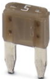
Fuse, nominal current: 5 A, length: 11.9 mm, width: 3.8 mm, height: 16.2 mm

Please be informed that the data shown in this PDF Document is generated from our Online Catalog. Please find the complete data in the user's documentation. Our General Terms of Use for Downloads are valid ( http://phoenixcontact.com/download )