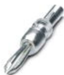
Test plugs, with solder connection up to 1 mm 2 conductor cross section, color: gray