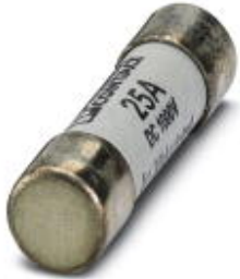
Fuse, 10.3x38 mm, up to 1000 V DC, gPV characteristics

Please be informed that the data shown in this PDF Document is generated from our Online Catalog. Please find the complete data in the user's documentation. Our General Terms of Use for Downloads are valid ( http://phoenixcontact.com/download )