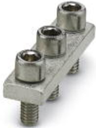
Fixed bridge, number of positions: 3, color: silver

Please be informed that the data shown in this PDF Document is generated from our Online Catalog. Please find the complete data in the user's documentation. Our General Terms of Use for Downloads are valid ( http://phoenixcontact.com/download )