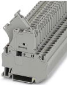
Lever-type fuse terminal block, gray, for 5 x 20 mm cartridge fuse-links, with LED for 24 V DC

Please be informed that the data shown in this PDF Document is generated from our Online Catalog. Please find the complete data in the user's documentation. Our General Terms of Use for Downloads are valid ( http://phoenixcontact.com/download )