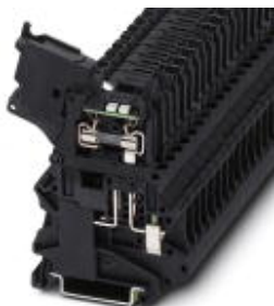
Lever-type fuse terminal block, black, for 5 x 20 mm G fuse inserts, with LED for 24 V DC

Please be informed that the data shown in this PDF Document is generated from our Online Catalog. Please find the complete data in the user's documentation. Our General Terms of Use for Downloads are valid ( http://phoenixcontact.com/download )