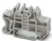
Quick mounting end clamp for NS 35/7,5 DIN rail or NS 35/15 DIN rail, with marking option, width: 9.5 mm, color: gray