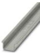
DIN rail, unperforated, Standard profile 2.3 mm, width: 35 mm, height: 15 mm, acc. to EN 60715, material: Steel, galvanized, passivated with a thick layer, length: 2000 mm, color: silver

DIN rail, unperforated - NS 35/15-2,3 UNPERF 2000MM - 1201798