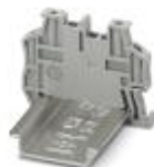
Quick mounting end clamp for NS 35/7,5 DIN rail or NS 35/15 DIN rail, with marking option, with parking option for FBS...5, FBS...6, KSS 5, KSS 6, width: 5.15 mm, color: gray