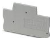
End cover, length: 68 mm, width: 2.2 mm, height: 39.6 mm, color: gray