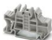
Quick mounting end clamp for NS 35/7,5 DIN rail or NS 35/15 DIN rail, with marking option, width: 9.5 mm, color: gray