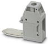
Pick-off terminal block, nom. voltage: 1000 V, nominal current: 57 A, connection method: Screw connection, number of connections: 1, cross section: 0.5 mm 2 - 10 mm 2 , AWG: 20 - 8, width: 10.2 mm, height: 34.7 mm, color: gray, mounting type: on base element

Pick-off terminal block - AGK 10-UKH 50 - 3001763