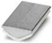
Insertion profile, color: silver