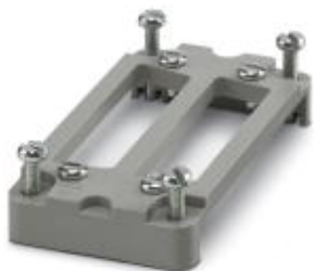
D-SUB adapter plate, for two D-SUB connectors, no. of positions 25, housing series HC-B 10...

Please be informed that the data shown in this PDF Document is generated from our Online Catalog. Please find the complete data in the user's documentation. Our General Terms of Use for Downloads are valid ( http://phoenixcontact.com/download )