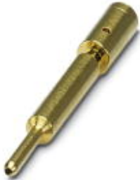
Crimp contact, turned, Single contact, contact diameter: 1 mm, crimp range: 0.5 mm 2 ... 1 mm 2

Please be informed that the data shown in this PDF Document is generated from our Online Catalog. Please find the complete data in the user's documentation. Our General Terms of Use for Downloads are valid ( http://phoenixcontact.com/download )