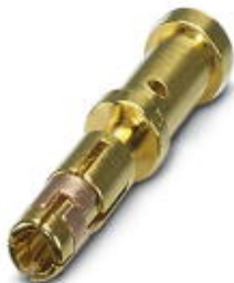
Crimp contact, turned, contact diameter: 1 mm, crimp range: 0.5 mm 2 ... 1 mm 2

Please be informed that the data shown in this PDF Document is generated from our Online Catalog. Please find the complete data in the user's documentation. Our General Terms of Use for Downloads are valid ( http://phoenixcontact.com/download )