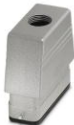
HEAVYCON sleeve housing D25, for single locking latch, height 72 mm, without support 1x M25, straight conductor exit

Please be informed that the data shown in this PDF Document is generated from our Online Catalog. Please find the complete data in the user's documentation. Our General Terms of Use for Downloads are valid ( http://phoenixcontact.com/download )