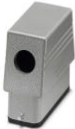
HEAVYCON sleeve housing D25, for single locking latch, height 72 mm, without support 1x M25, lateral conductor exit

Please be informed that the data shown in this PDF Document is generated from our Online Catalog. Please find the complete data in the user's documentation. Our General Terms of Use for Downloads are valid ( http://phoenixcontact.com/download )