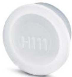
Plastic protection cap for connectors with M40 SPEEDCON knurled nut

Please be informed that the data shown in this PDF Document is generated from our Online Catalog. Please find the complete data in the user's documentation. Our General Terms of Use for Downloads are valid ( http://phoenixcontact.com/download )