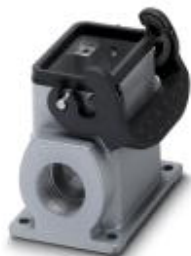
HEAVYCON box mounting base B6, with single locking latch. Height 74 mm, with support 1x M32

Please be informed that the data shown in this PDF Document is generated from our Online Catalog. Please find the complete data in the user's documentation. Our General Terms of Use for Downloads are valid ( http://phoenixcontact.com/download )