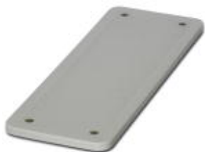
HEAVYCON cover plate, for panel cutouts of type B24/HV16, 3.5 mm thick, gray

Please be informed that the data shown in this PDF Document is generated from our Online Catalog. Please find the complete data in the user's documentation. Our General Terms of Use for Downloads are valid ( http://phoenixcontact.com/download )