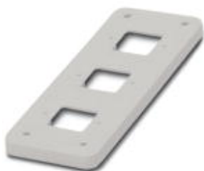
HEAVYCON adapter plate with a reinforced wall, three openings for D7 panel mounting base; type B24 on 3xD7, for panel cutouts of type B24; gray

Please be informed that the data shown in this PDF Document is generated from our Online Catalog. Please find the complete data in the user's documentation. Our General Terms of Use for Downloads are valid ( http://phoenixcontact.com/download )