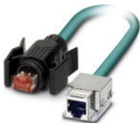
Assembled Ethernet cable, CAT6, shielded, 4-pair, AWG 26 stranded (7-wire), RAL 5021 (water blue), RJ45 socket module/IP20 for Freenet system, 8-pos. on RJ45 plug/IP67, black, line, length 5 m

Please be informed that the data shown in this PDF Document is generated from our Online Catalog. Please find the complete data in the user's documentation. Our General Terms of Use for Downloads are valid ( http://phoenixcontact.com/download )