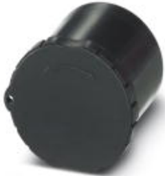
Plastic protection cap, with eye, IP40 for connectors with M23 external thread, RF, SF series

Please be informed that the data shown in this PDF Document is generated from our Online Catalog. Please find the complete data in the user's documentation. Our General Terms of Use for Downloads are valid ( http://phoenixcontact.com/download )