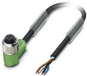
Sensor/actuator cable, 4-position, PVC, black RAL 9005, free cable end, on Socket angled M12, A-coded, cable length: 3 m

Please be informed that the data shown in this PDF Document is generated from our Online Catalog. Please find the complete data in the user's documentation. Our General Terms of Use for Downloads are valid ( http://phoenixcontact.com/download )