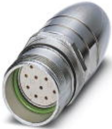
Coupling connector, straight, shielded: yes, Screw locking, M23, No. of pos.: 8+1, type of contact: Socket, Solder connection

Please be informed that the data shown in this PDF Document is generated from our Online Catalog. Please find the complete data in the user's documentation. Our General Terms of Use for Downloads are valid ( http://phoenixcontact.com/download )