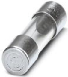
Replacement fuse, for the crimping device CF 3000-2,5

Please be informed that the data shown in this PDF Document is generated from our Online Catalog. Please find the complete data in the user's documentation. Our General Terms of Use for Downloads are valid ( http://phoenixcontact.com/download )