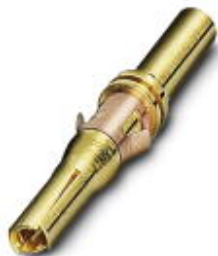
Crimp contact, turned, contact diameter: 1.5 mm, crimp range: 0.75 mm² ... 1 mm²

Please be informed that the data shown in this PDF Document is generated from our Online Catalog. Please find the complete data in the user's documentation. Our General Terms of Use for Downloads are valid ( http://phoenixcontact.com/download )