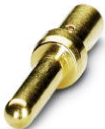
Crimp contact, turned, contact diameter: 2 mm, crimp range: 1.5 mm 2 ... 2.5 mm 2

Please be informed that the data shown in this PDF Document is generated from our Online Catalog. Please find the complete data in the user's documentation. Our General Terms of Use for Downloads are valid ( http://phoenixcontact.com/download )