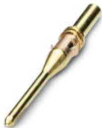
Crimp contact, turned, contact diameter: 1.5 mm, crimp range: 0.75 mm 2 ... 1 mm 2

Please be informed that the data shown in this PDF Document is generated from our Online Catalog. Please find the complete data in the user's documentation. Our General Terms of Use for Downloads are valid ( http://phoenixcontact.com/download )