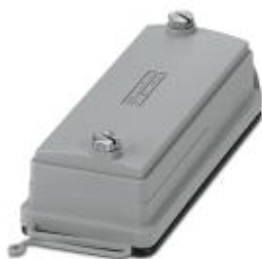
HEAVYCON ADVANCE, IP66, B16 protective cover, for panel mounting side, with screw locking, with retaining cord, diameter of retaining cord eyelet: 3 mm

Please be informed that the data shown in this PDF Document is generated from our Online Catalog. Please find the complete data in the user's documentation. Our General Terms of Use for Downloads are valid ( http://phoenixcontact.com/download )