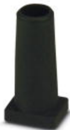
Bend protection sleeve, color: black

Please be informed that the data shown in this PDF Document is generated from our Online Catalog. Please find the complete data in the user's documentation. Our General Terms of Use for Downloads are valid ( http://phoenixcontact.com/download )